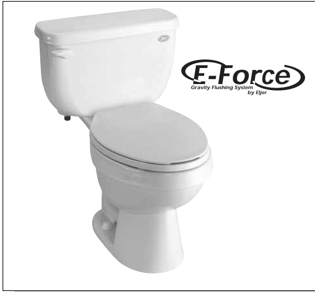
Patriot 17" Elongated-Rim Toilet, 10" Rough-In (091-2165)

Note: Dimensions May Vary +/- 1/2" and are Subject to Change or Cancellation